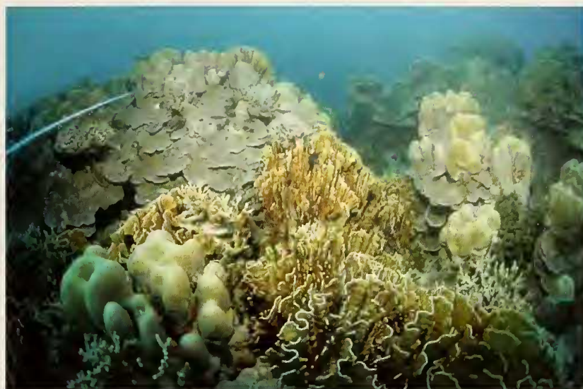
Figure 12. Intact coral reef at 4 m water depth clearly showing healthy Porites spp. (far left and far right) and Heliopora coerulea (centre front) colonies along transect line at Teluk Balohan, Pulau Weh, October 28, 2005. Transect line shown back left.